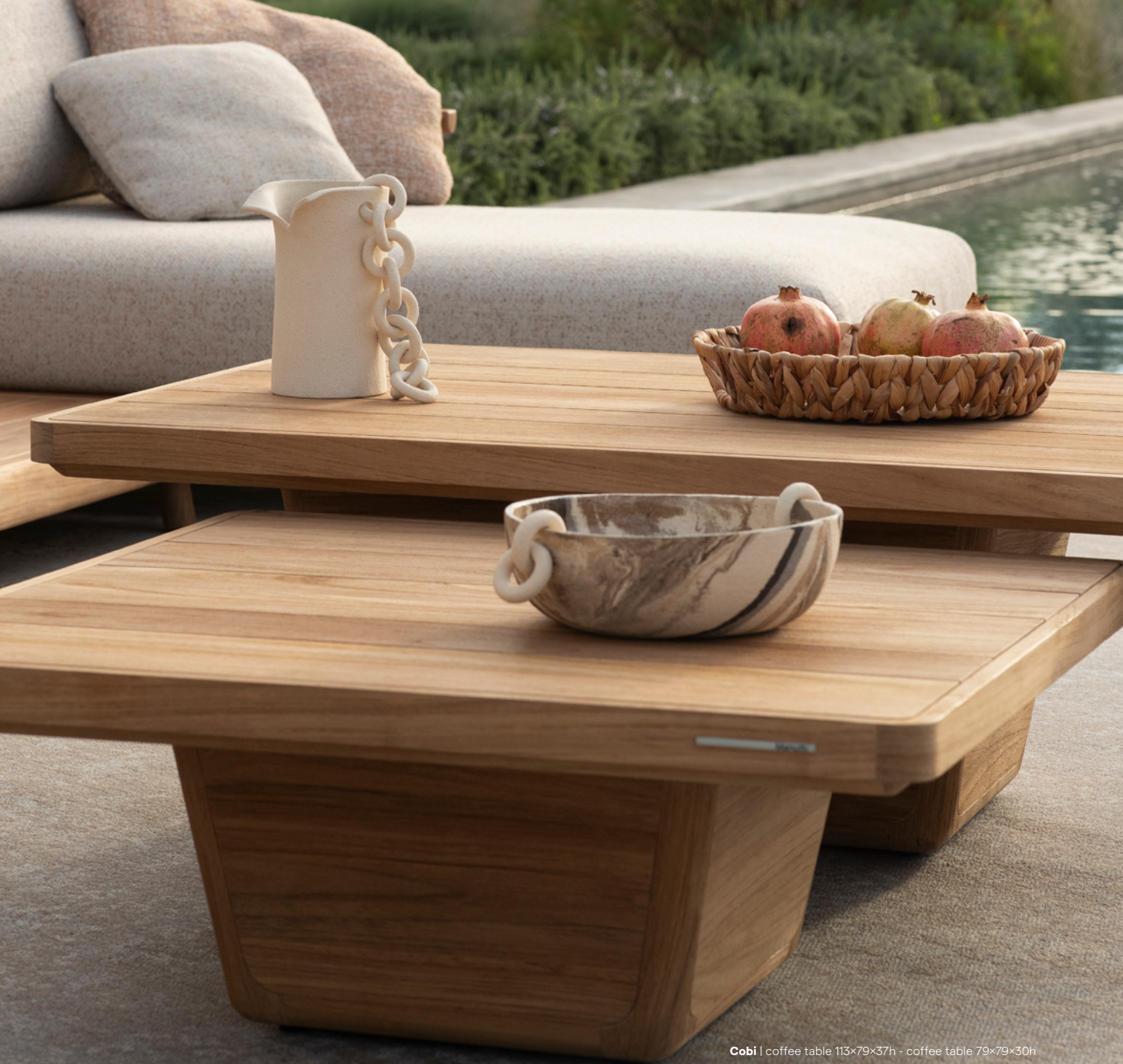
Cobi | coffee table 113×79×37h - coffee table 79×79×30h