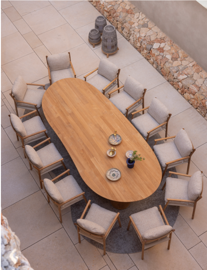
Ogado | dining table 310x135x75h