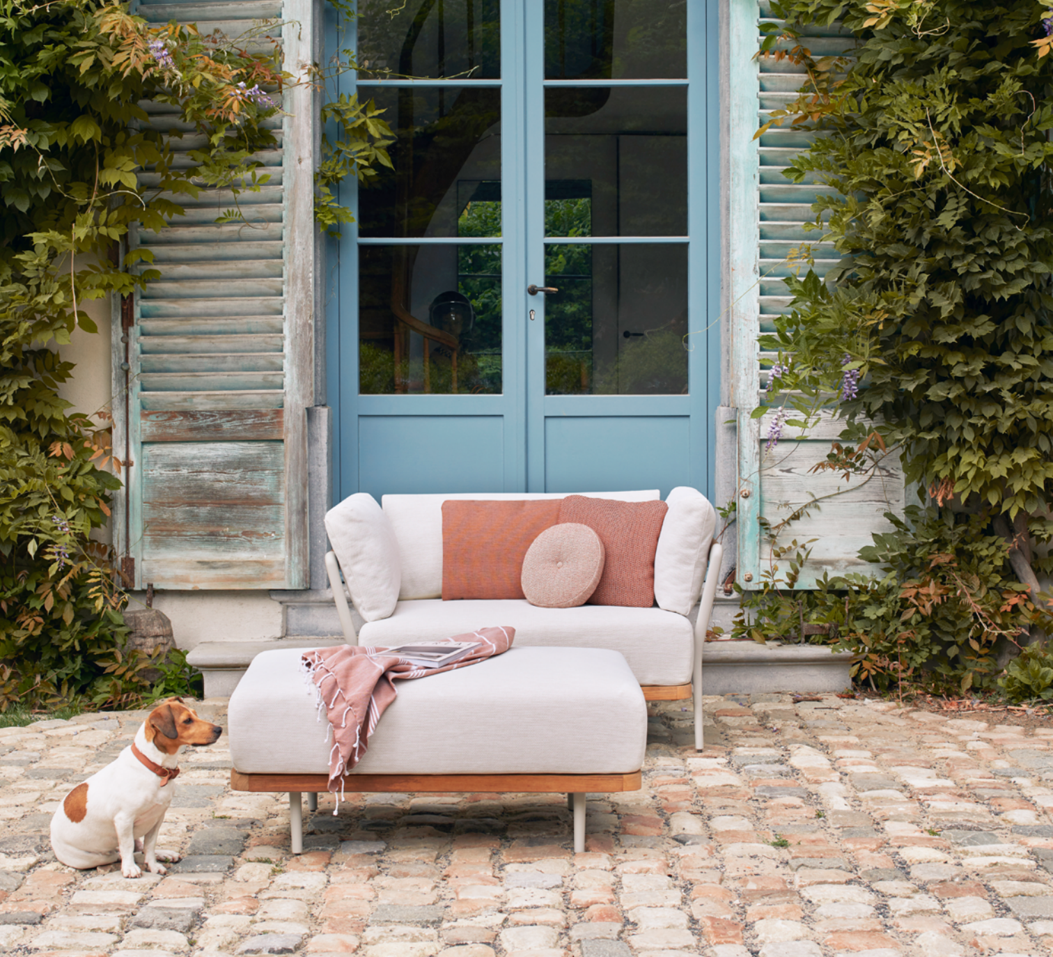
Flows | lounge chair - large footstool