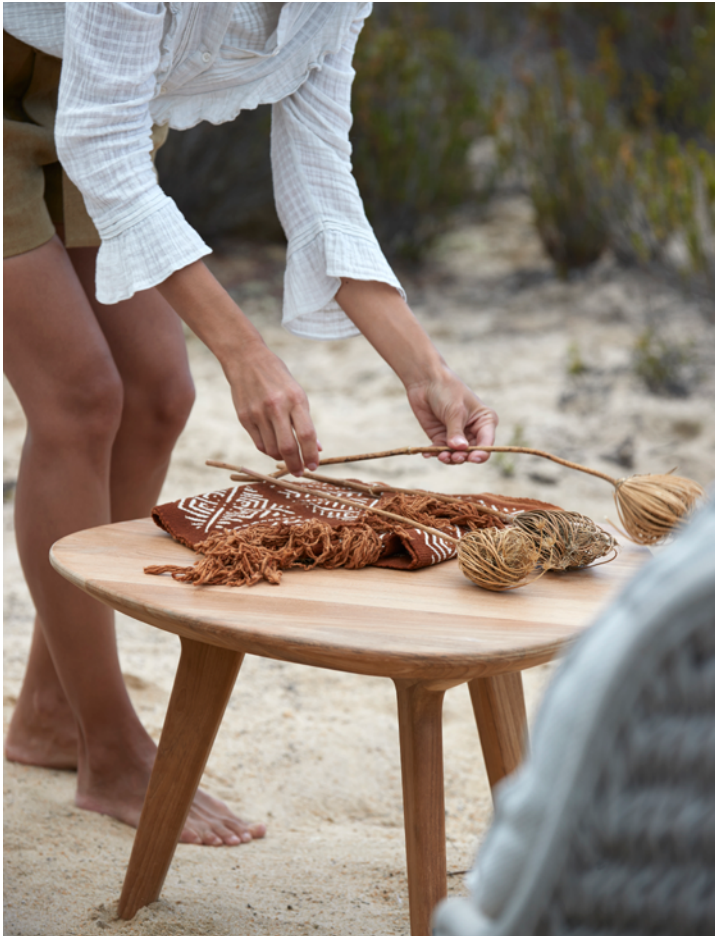
Torsa | organic coffee table Ø60x35h