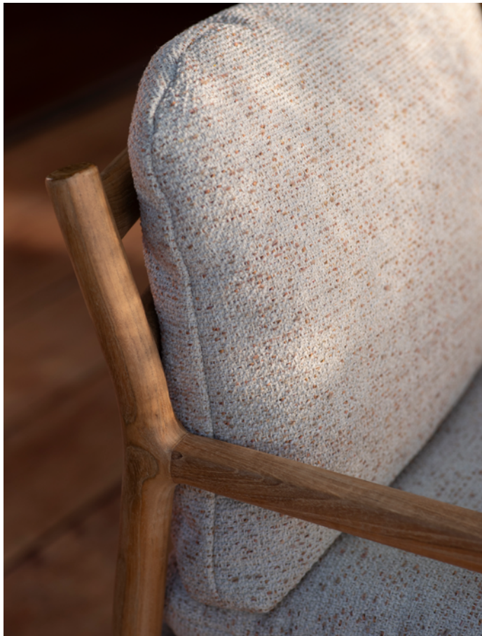
Muyu | dining chair