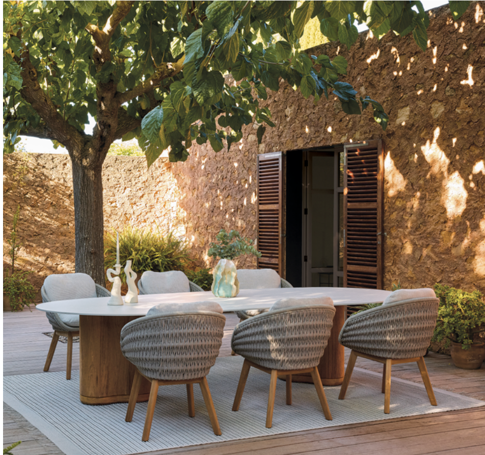
Ogado | dining table 310x135x73h