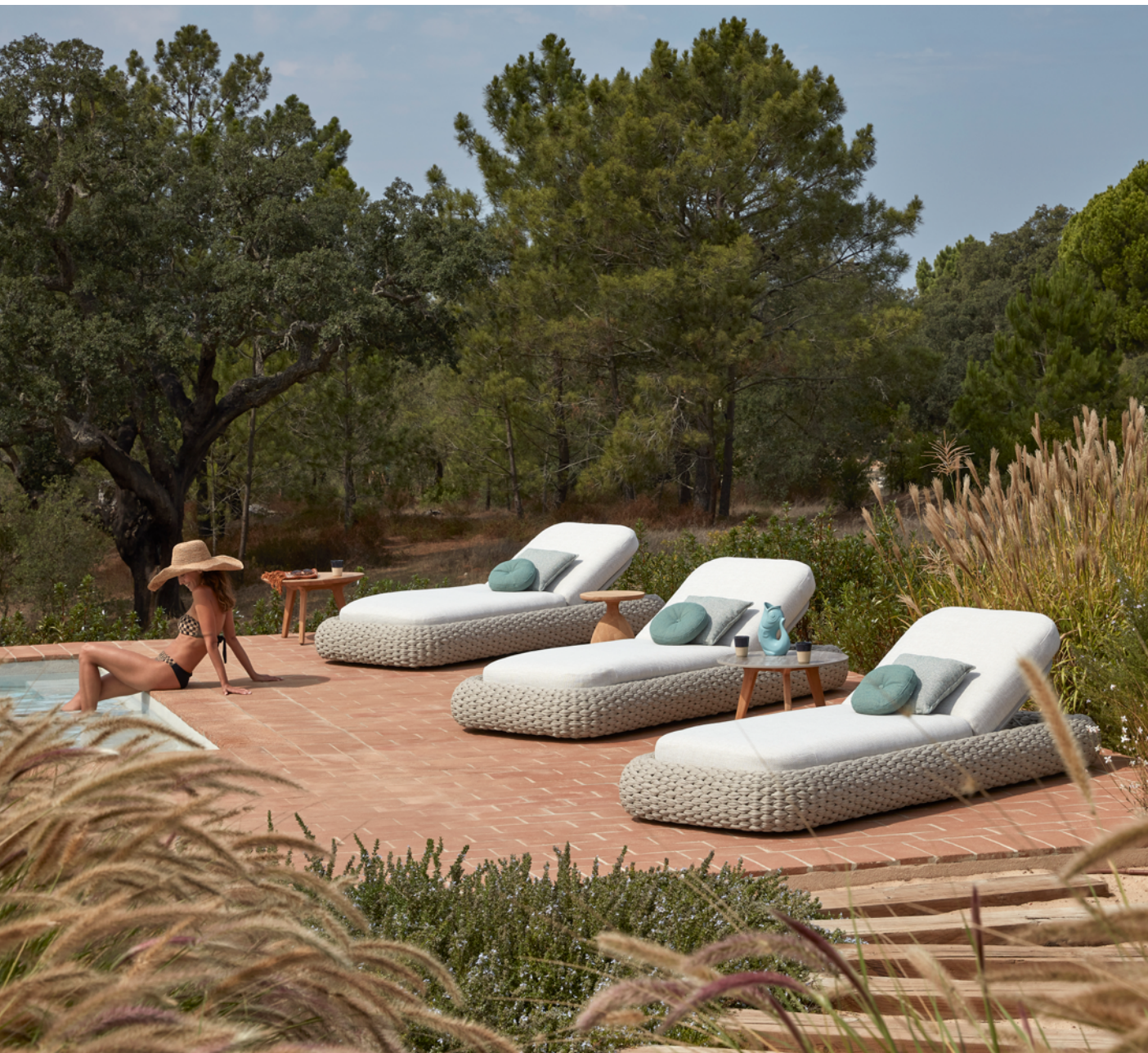
Kobo | sun lounger