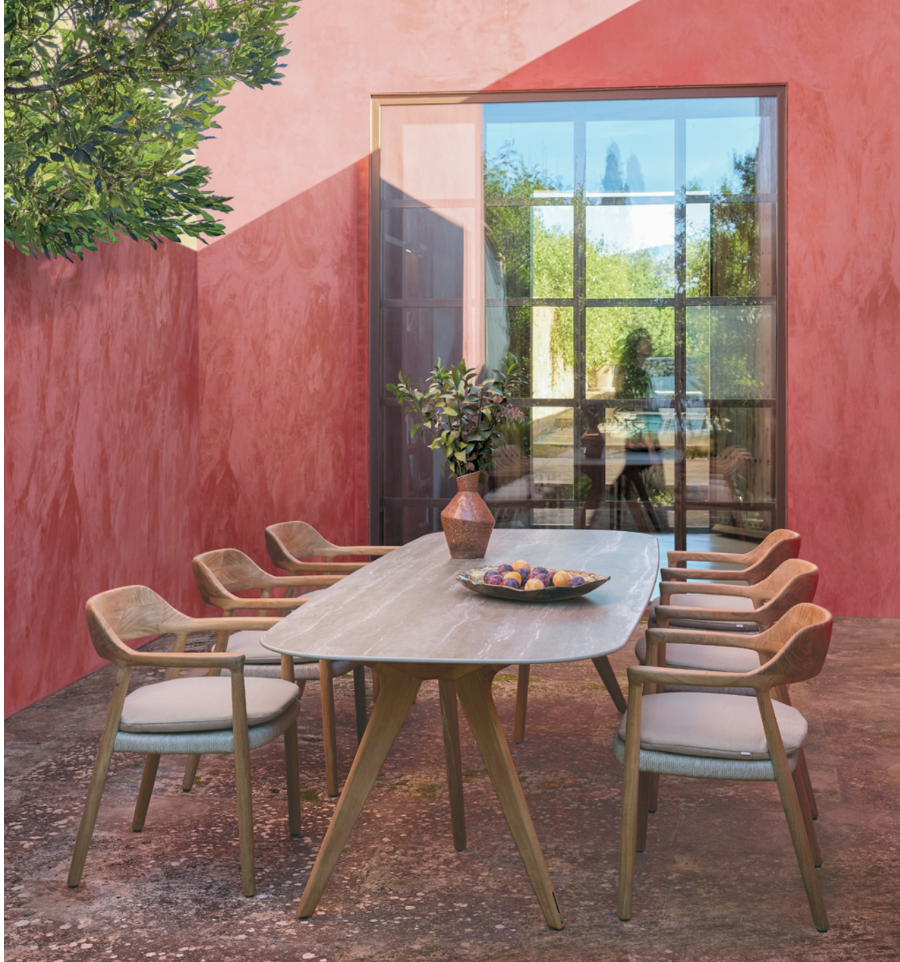
Yiko | dining chair