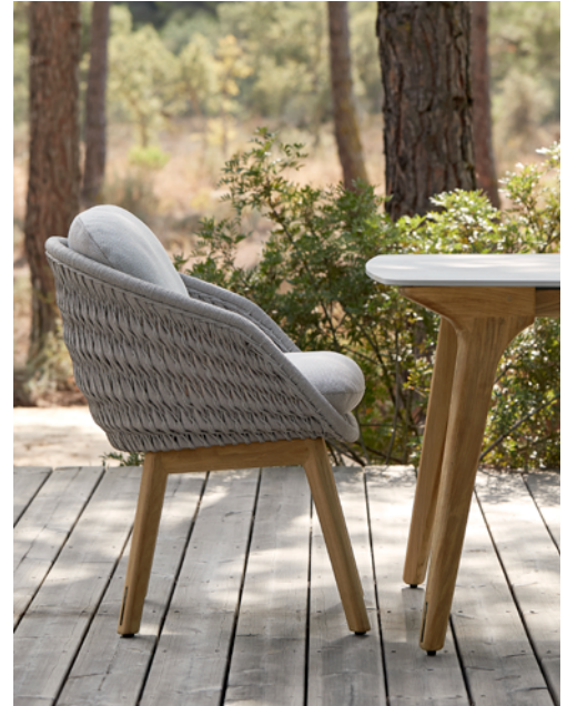
Sandua | dining chair Torsa | dining table 264x118x73h