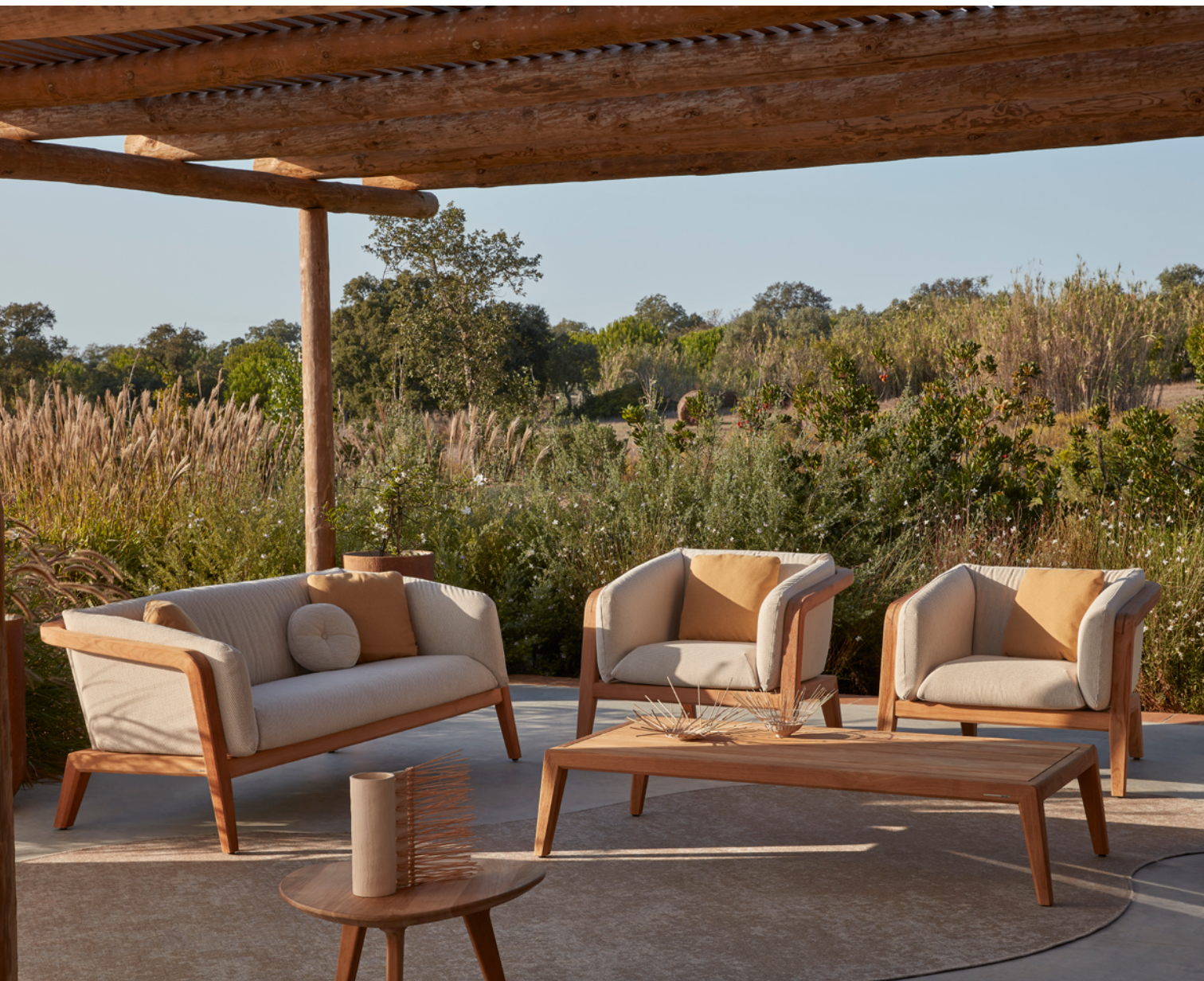
Sunrise | lounge chair - 2-seater sofa - coffee table 165×74×35h