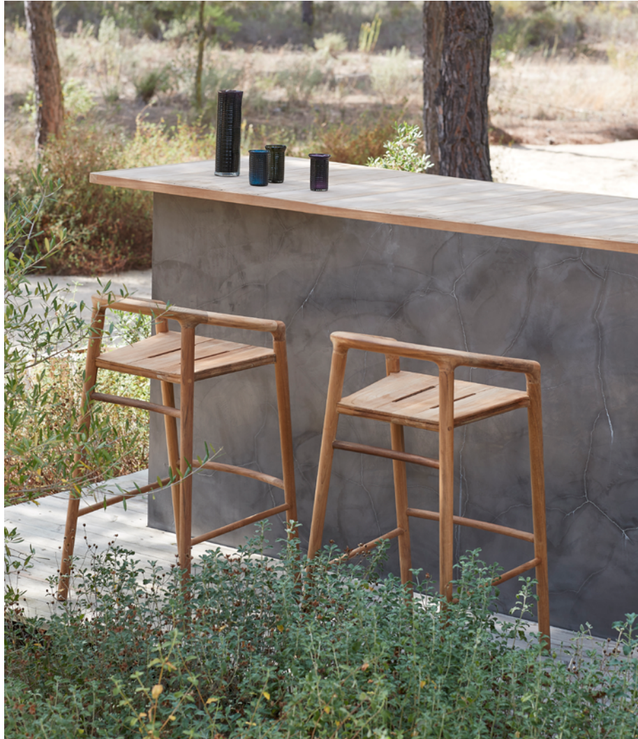
Solid | bar stool with back - 79