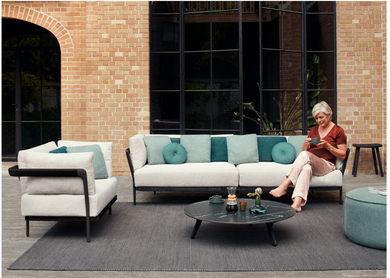
Flows | lounge chair - 3-seater sofa