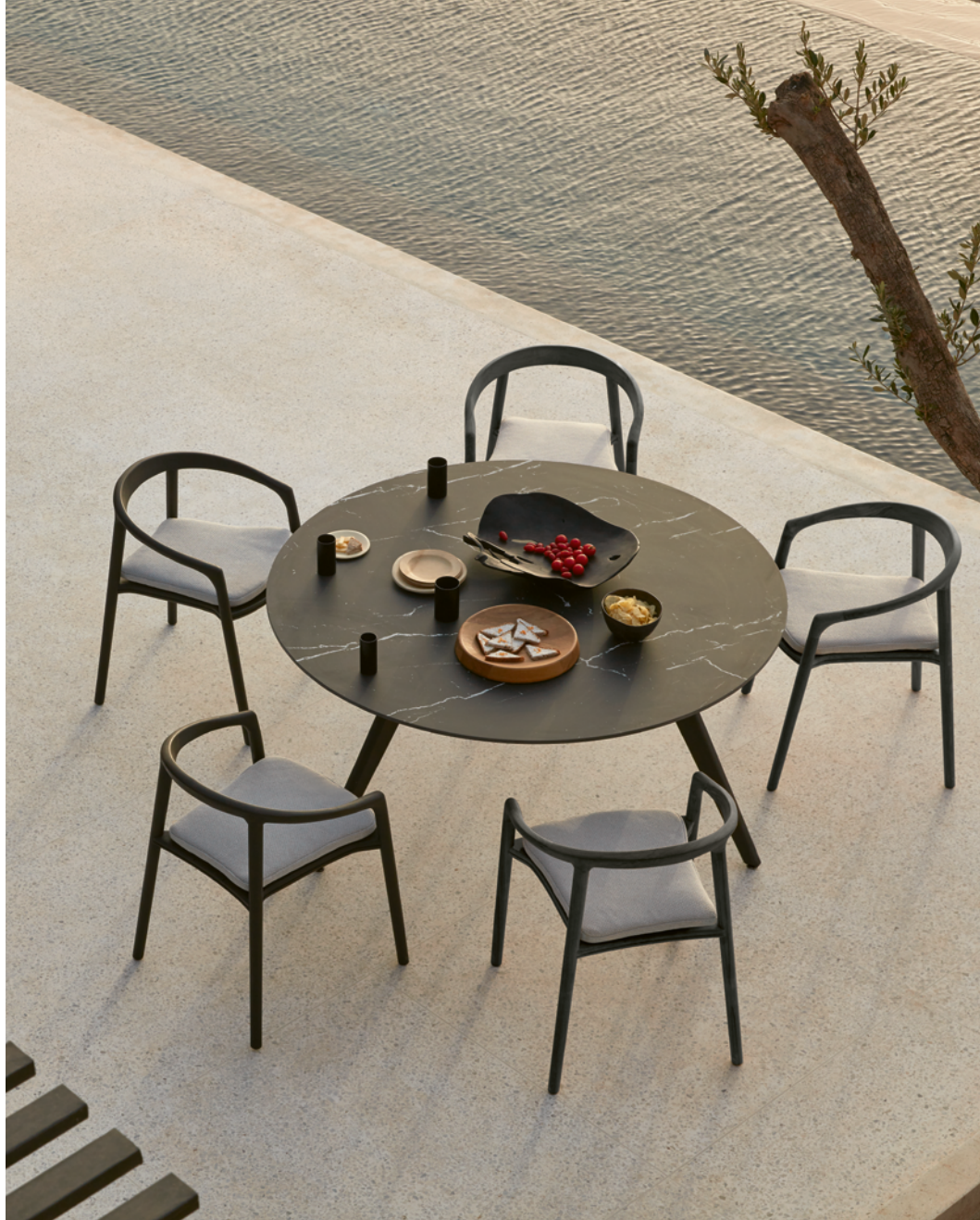
Solid | dining chair