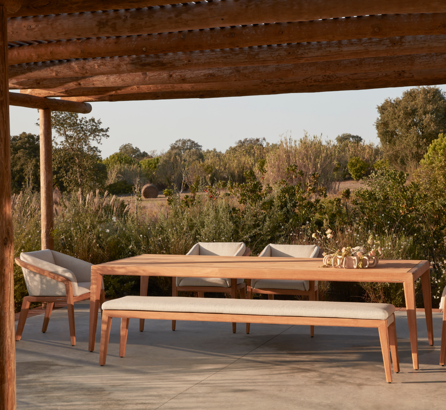
Sunrise | dining table 285×110 76h - dining bench 235×42 - dining chair