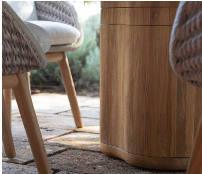
Ogado | dining table Ø148×73h