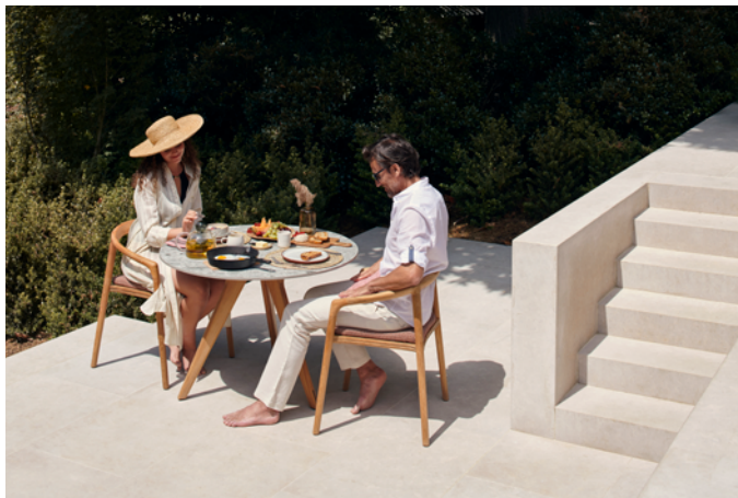
Torsa | dining table Ø100 - 73h