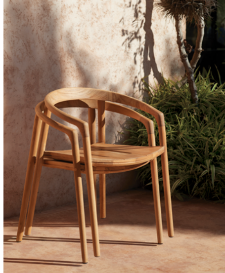
Solid | dining chair