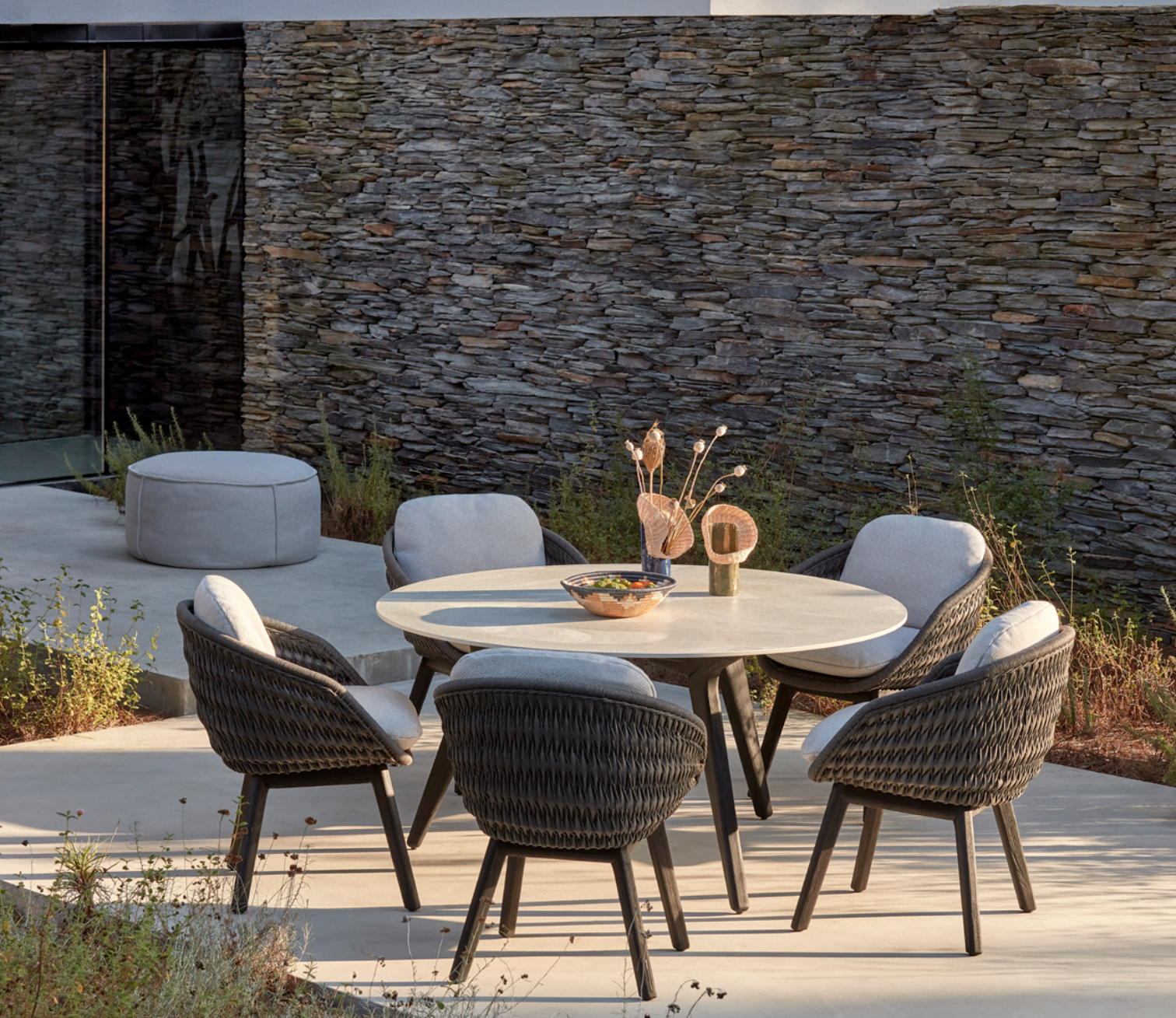
Touch | pouf Ø52