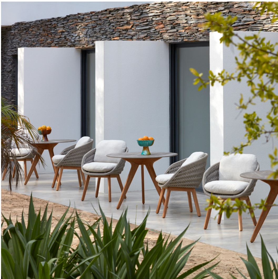
Torsa | dining table Ø100 - 73h