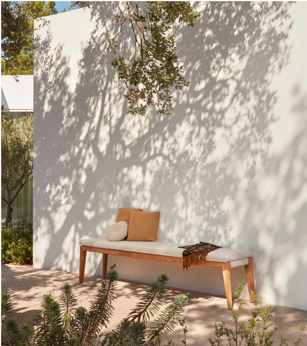
Sunrise | dining bench 235×42