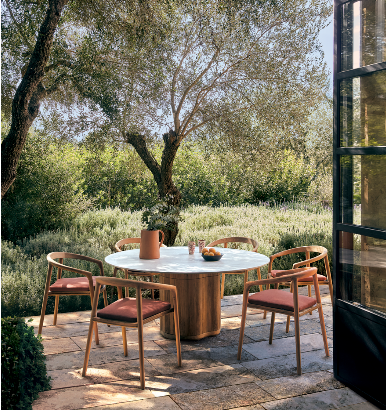
Solid | dining chair