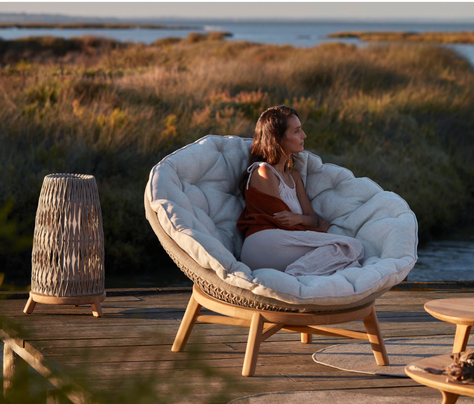
Sandua | outdoor lighting LED large - papasan chair