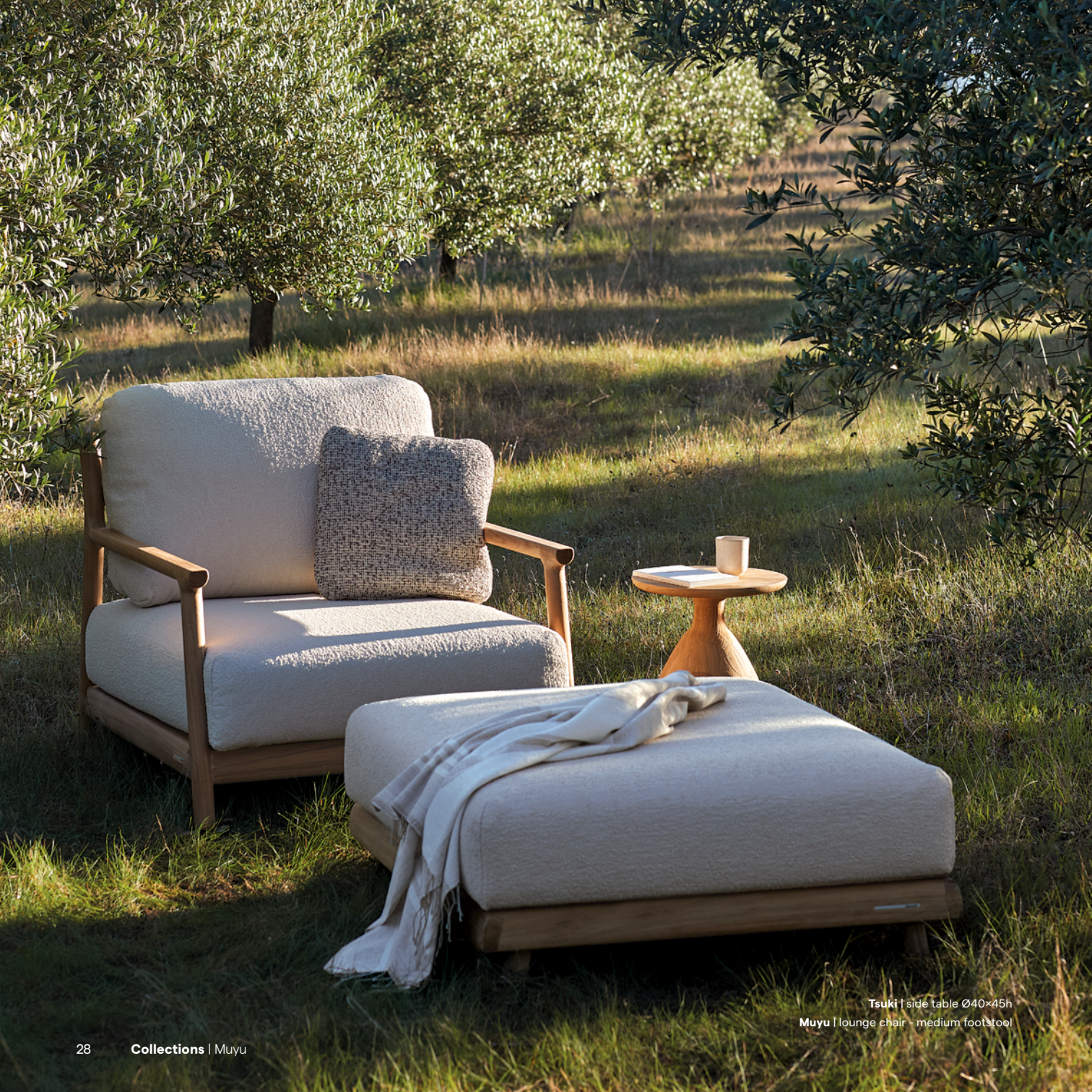
Tsuki | side table Ø40x45h Muyu | lounge chair - medium footstool