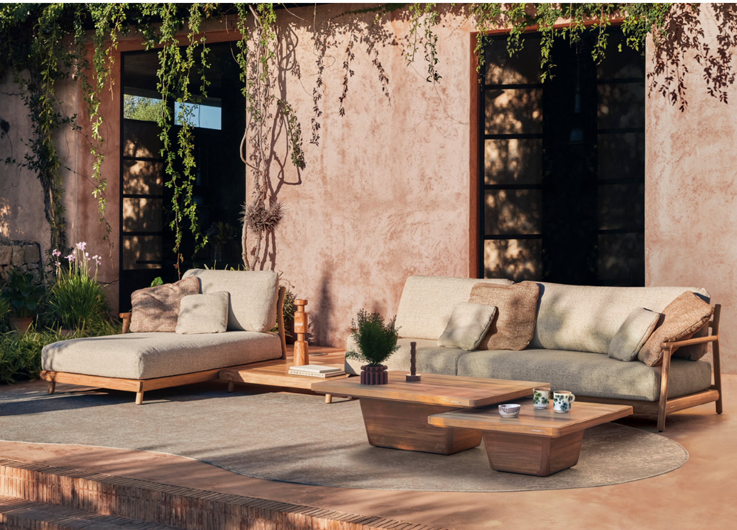
Muyu | sofa set 1