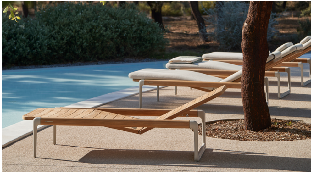
Flows | sun lounger