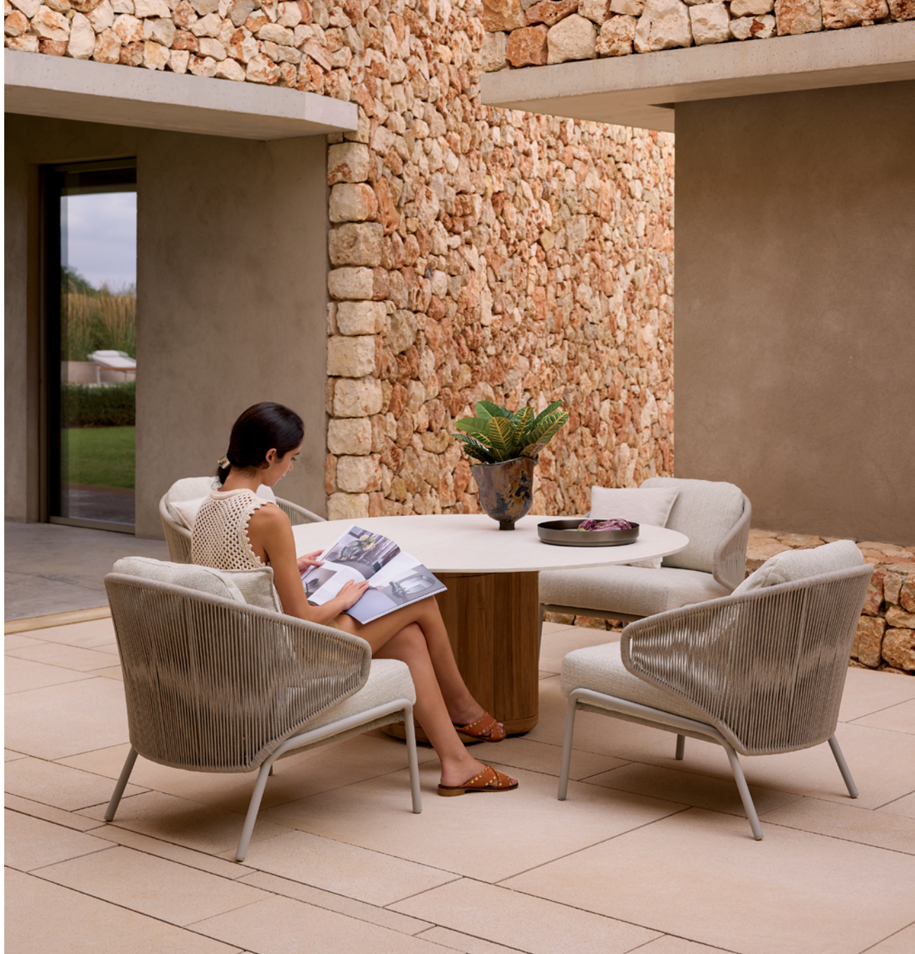
Ogado | low dining table Ø148x73h