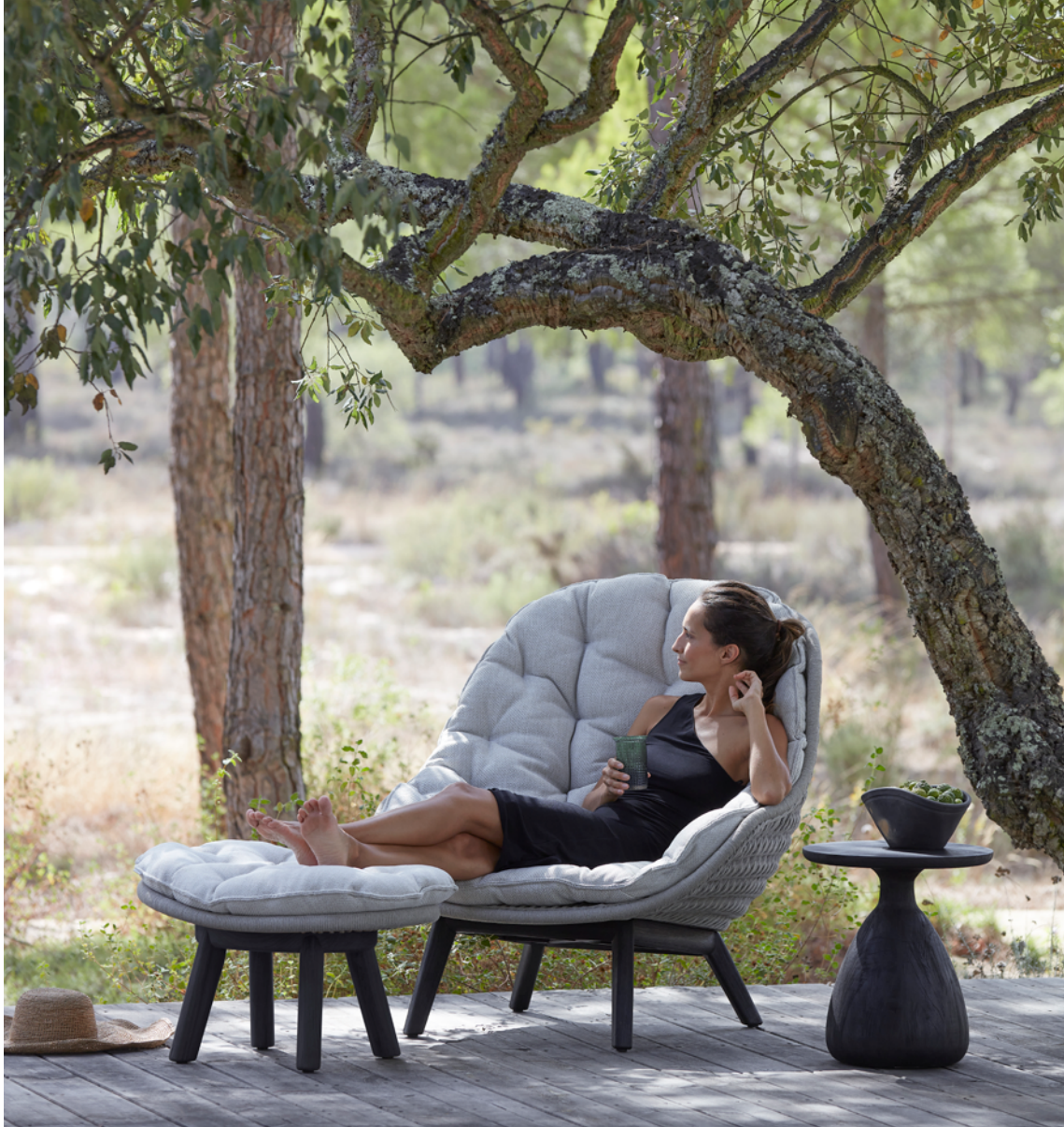
Sandua | high back lounge chair - footstool