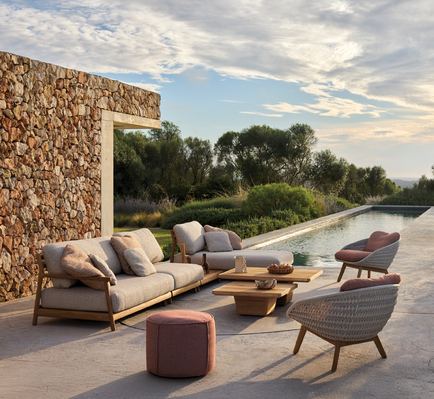
Muyu | sofa set 1