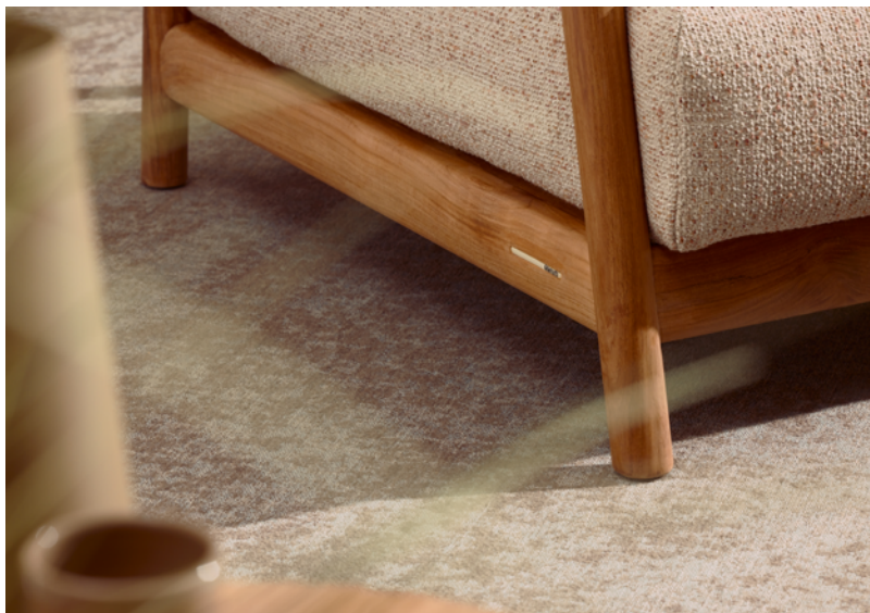
Muyu | lounge chair