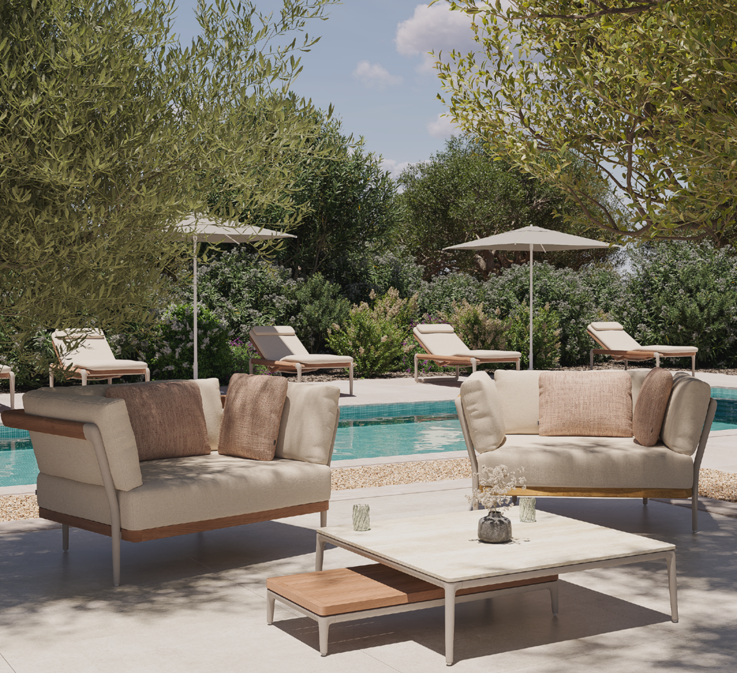
Flows | lounge chair - sun lounger teak