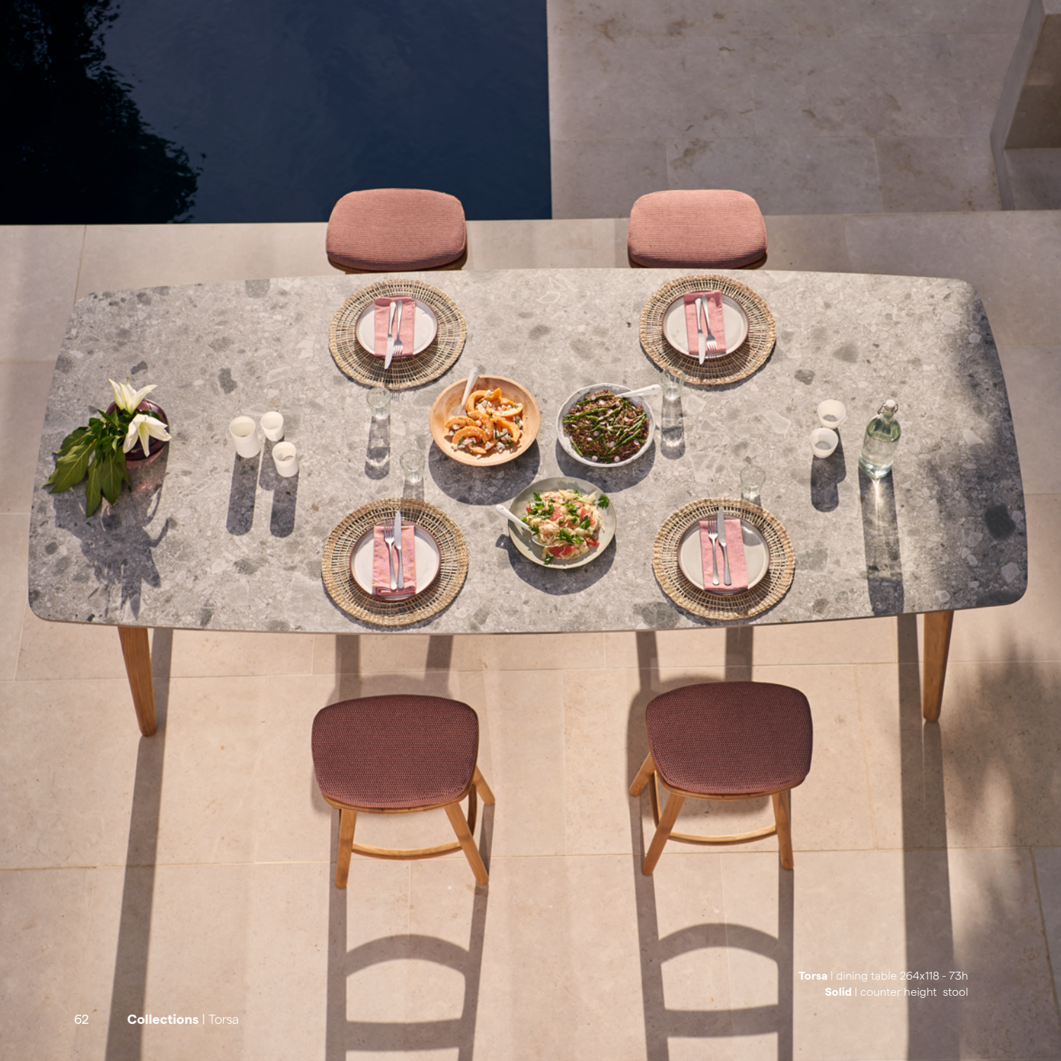
Torsa | dining table 264x118 - 73h Solid | counter height stool