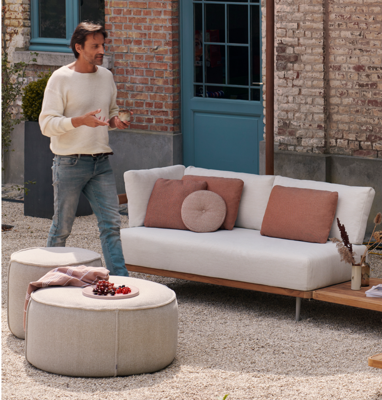
Touch | pouf Ø52 - pouf Ø82