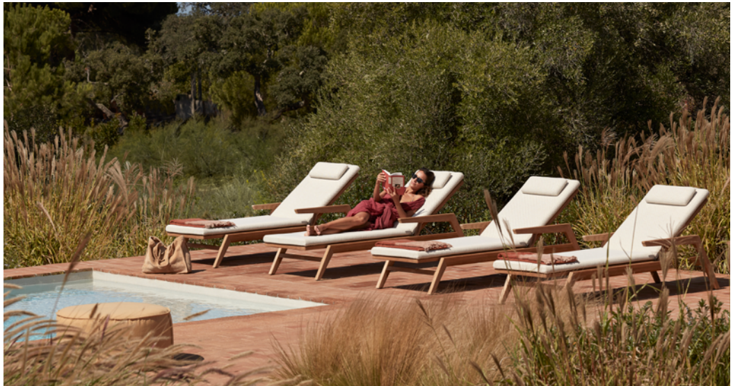
Touch | pouf Ø82