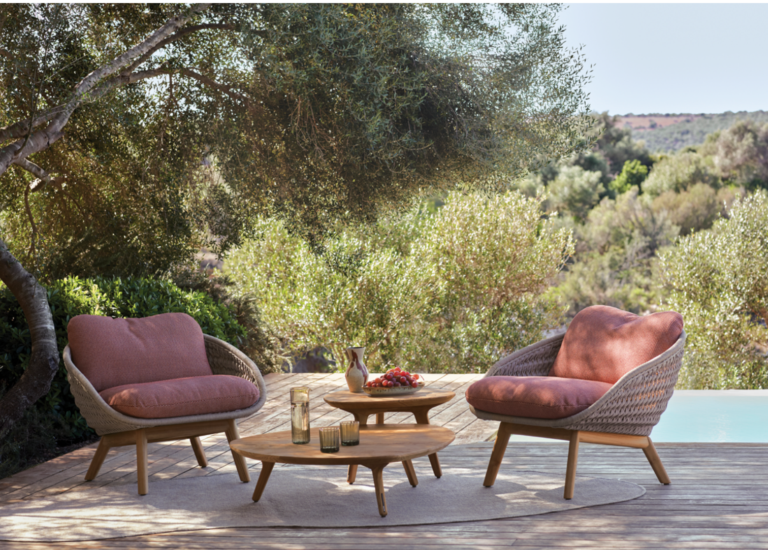
Torsa | organic coffee table Ø100x24h - organic coffee table Ø60x35h