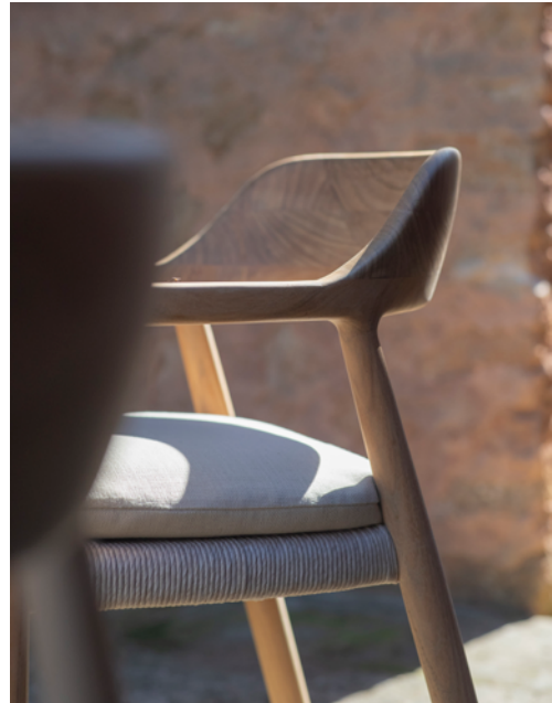
Yiko | dining chair