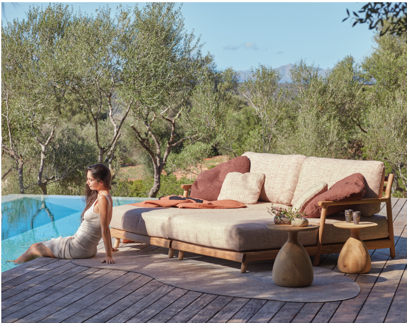
Tsuki | side table Ø40x45h - side table Ø35x39h Muyu | daybed