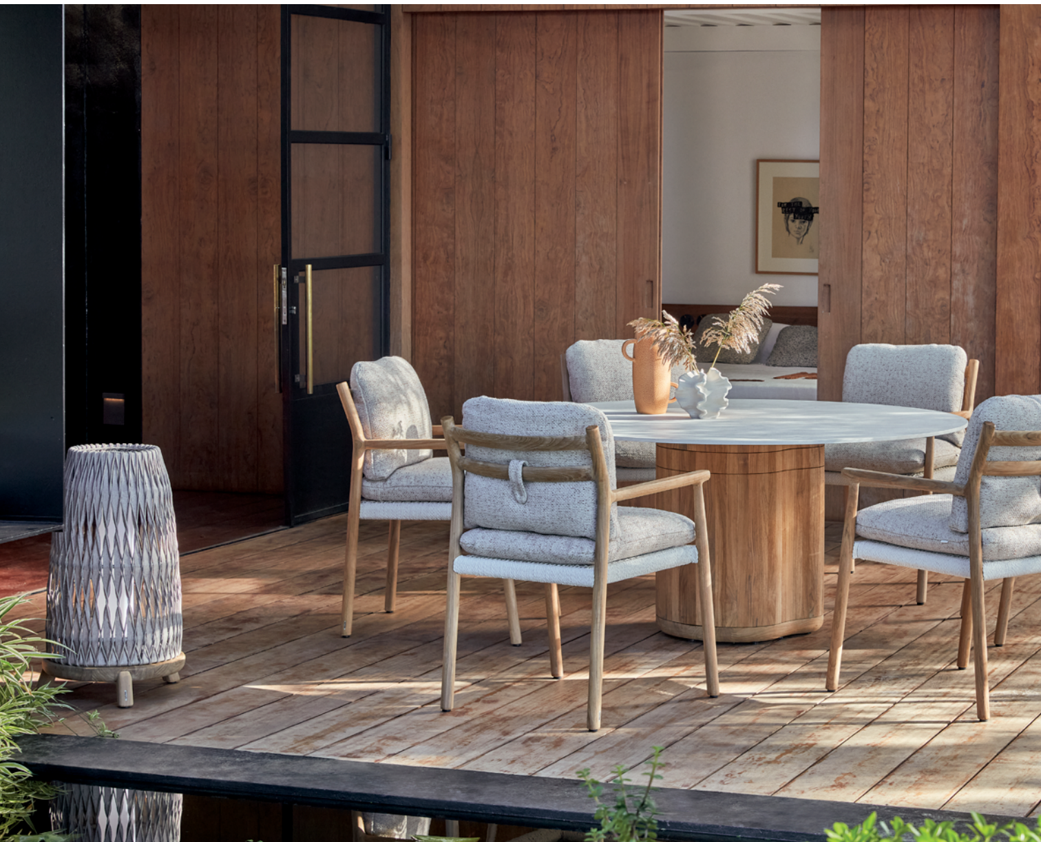
Sandua | outdoor lighting LED large - medium - small