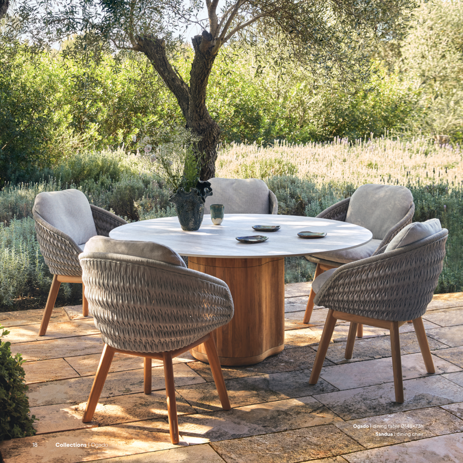
Ogado | dining table Ø148x73h Sandua | dining chair