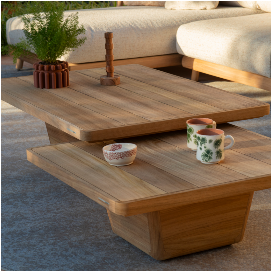
Cobi | coffee table 113×79×37h - coffee table 79×79×30h