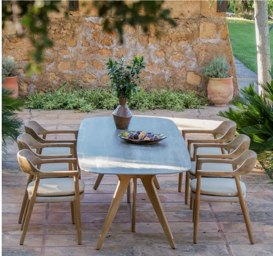
Yiko | dining chair