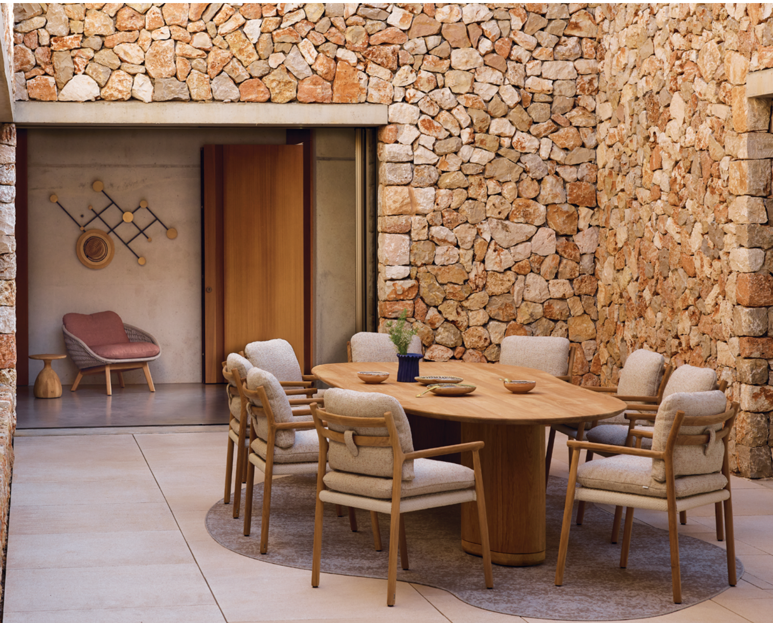
Tsuki | side table Ø35×39h