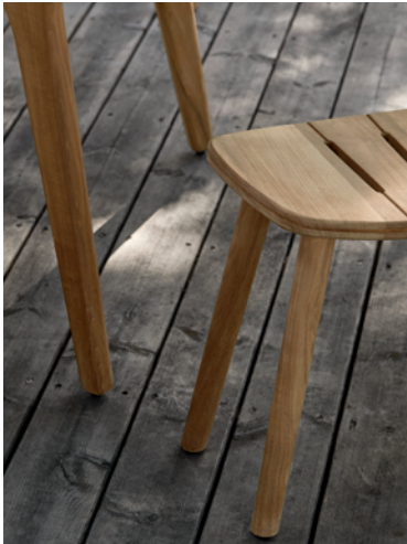
Solid | stool - 47