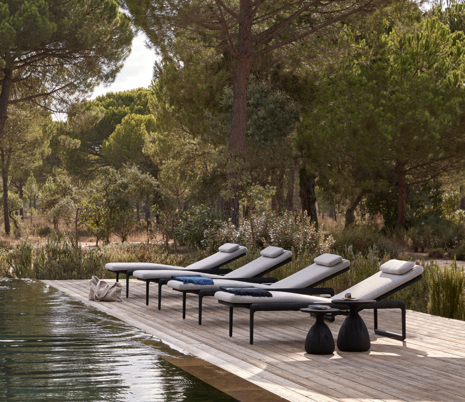
Flows | sun lounger